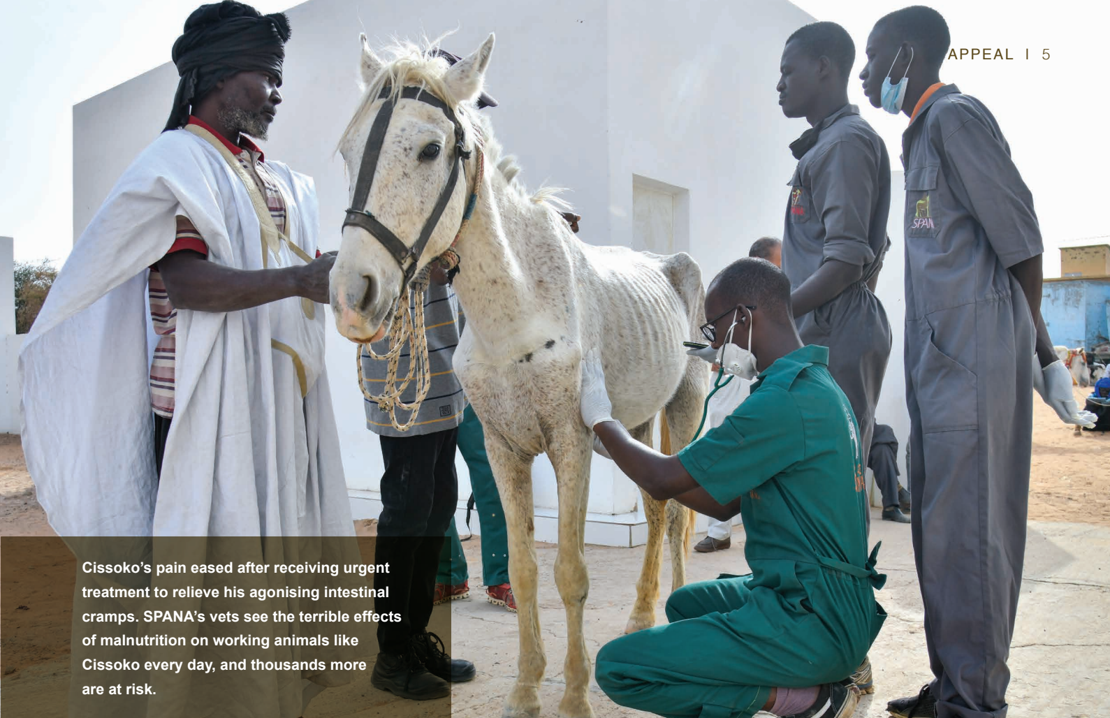
Cissoko's pain eased after receiving urgent treatment to relieve his agonising intestinal cramps. SPANA's vets see the terrible effects of malnutrition on working animals like Cissoko every day, and thousands more are at risk.