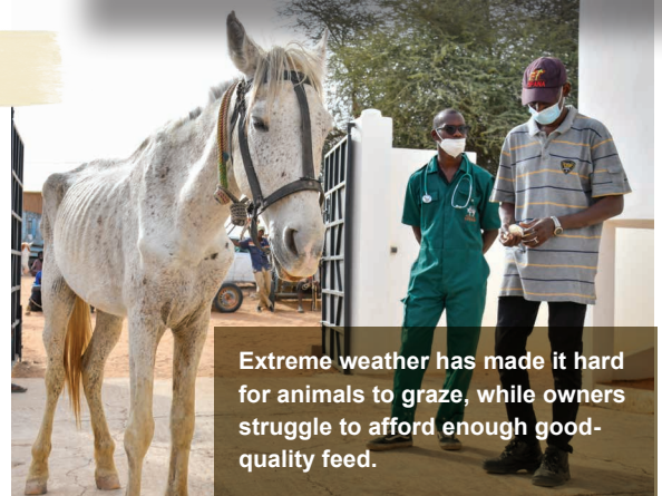
Extreme weather has made it hard for animals to graze, while owners struggle to afford enough good-quality feed.