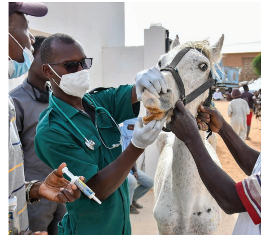
Cissoko's diet had consisted of hard-to-digest dry straw and grain. During the examination, the team checked his teeth to make sure he could chew his food properly.